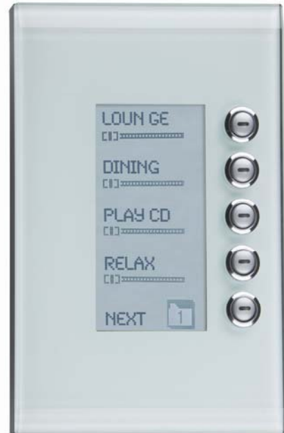
Figure 1: Saturn DLT Keypad