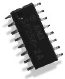
Seriplex V2 chip