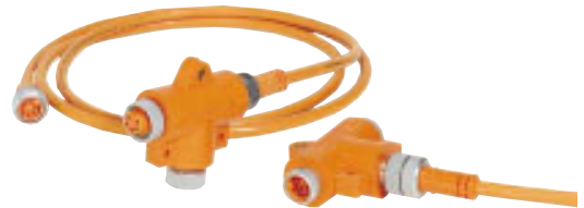
T-connector and cable